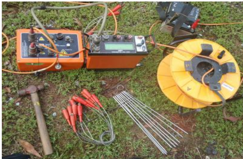
Figure (1) Tools and equipment used in electrical resistivity imaging.

Resistivity measurements are based on the difference of resistivity values between different sub-surface materials. The 2D electrical resistivity imaging survey is employed in the proposed site with ABEM SAS4000 multi electrodes system as shown in Figure (1).