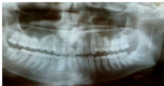
Figure(2): Conventional panoramic radiograph showing radiopaque reference object near mesially angulated mandibular third molar(left side)

Manual caliper (ruler) was used to measure on panoramic radiograph the radiographic length of the reference object ( radiopaque wire) of known length fixed on patient's cheek using adhesive strip against the ramus area of mandible , as shown in Figure (2)