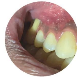
Fig. (1): Intra oral gingival lesion associated molar teeth.