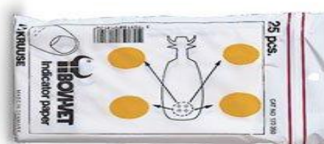
Figure (1): Card test.

The pH of milk samples were measured using the Bovi Vet. Indicator paper (Fig.1)