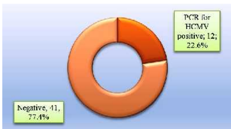
Figure-1: Results of real time PCR for HCMV DNA among chronic periodontitis patients.