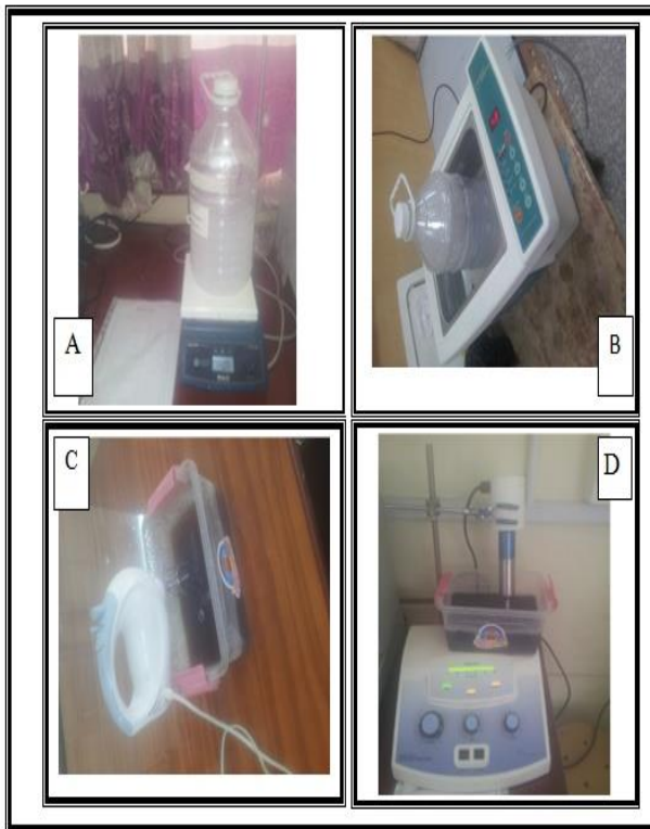
Figure 1: A-Magnetic stirrer, B- Ultrasonic or bath sonicator C-Electrical blender, D-Ultra sonicator probe sonicator