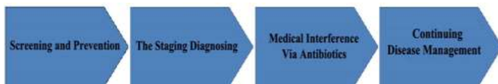
Fig. (1) Health affects the value care delivery

This problem has contributed to the development of medical information and the speed of its arrival with the possibility of accessing it from anywhere, the existence of a smart mobile device allows access to the Internet. Mobile devices have many tasks and functions that are used to connect to the Internet more easily and quickly. This service helps smartphone users to get medical information anywhere at any time. This has contributed to the emergence of many medical apps that provide sufficient information to the patient about his illness at any time with the latest updates of this information [4]. Fig. (1) below, Health affects the value care delivery.