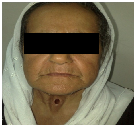
Figure 6: the patient after three years of her treatment