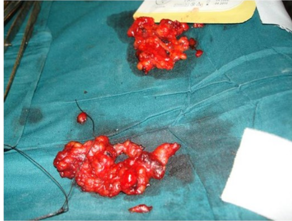
Figure 4 b: bilateral neck dissection