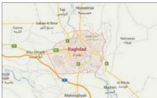
Figure 1: Outskirts of Baghdad [5]